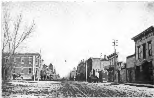
MAIN STREET, FOREST CITY, 1896